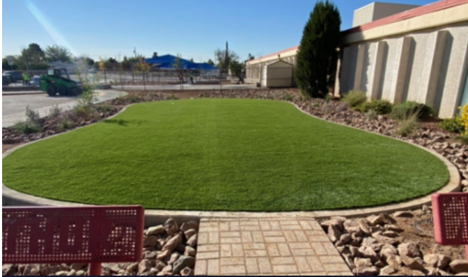
GENERAL DOUGLAS MACARTHUR PK-8