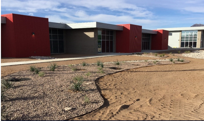
DR. JOSEPH TORRES ELEMENTARY