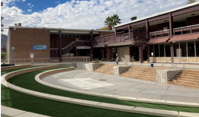
ANDRESS HIGH SCHOOL