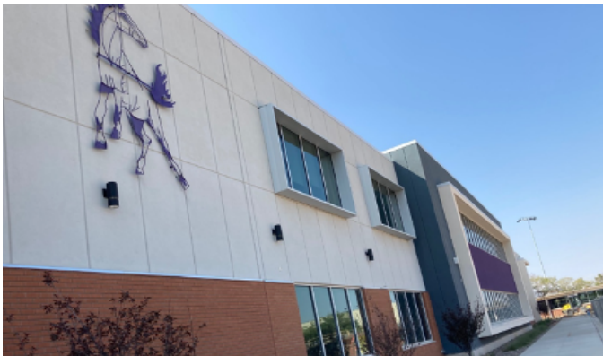
BURGES HIGH SCHOOL

For more information on the project click here .