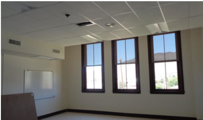
AUSTIN HIGH SCHOOL

For more information on the project click here .