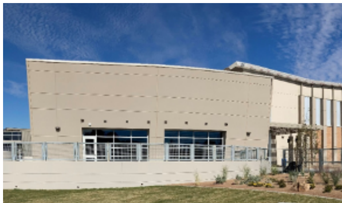
DON HASKINS PK-8

For more information on the project click here .