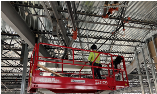
JEFFERSON /SILVA HIGH SCHOOL

For more information on the project click here .