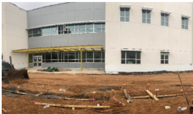
BOBBY JOE HILL PK-8

For more information on the project click here .