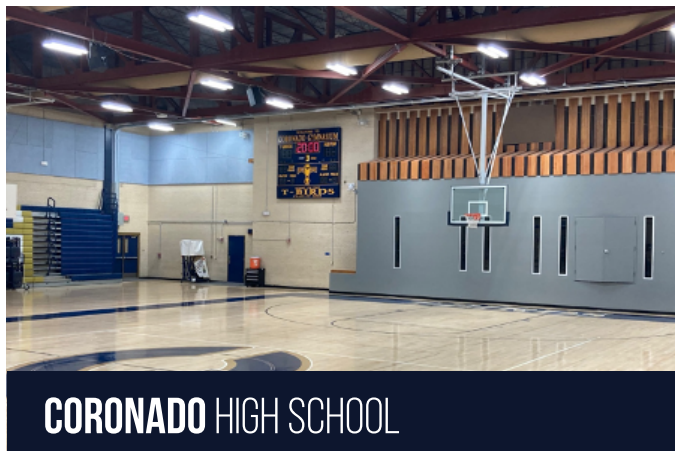
CORONADO HIGH SCHOOL