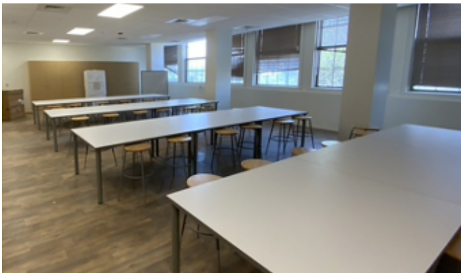
EL PASO HIGH SCHOOL

For more information on the project click here .