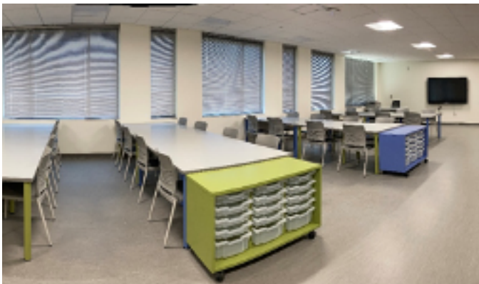
IRVIN HIGH SCHOOL

For more information on the project click here .