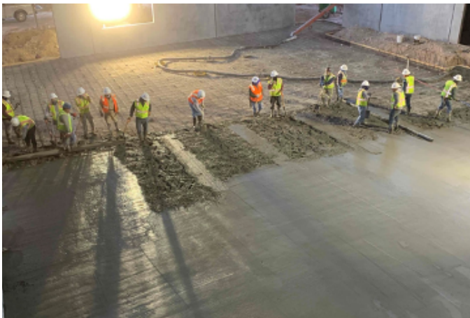
CHARLES Q. MURPHREE PK-8

For more information on the project click here .